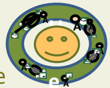
Image and graphic sources: